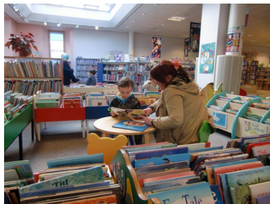
Visiting the local library with the children is enjoyed by learners and children. Learners cover the risk assessment of external trips.