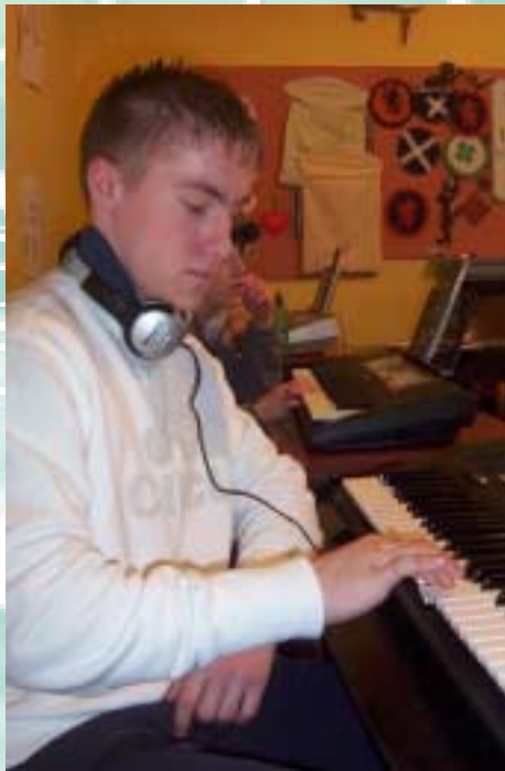
Part of the new music facility

A former colleague of mine was fond of saying "Life without challenge is tedious". At the end of my first year as chairman of the Helm Board I can report that life at the Helm is never tedious. Despite the many and varied challenges the organisation continues to flourish and has settled into its new structure with all Dundee staff and students accommodated in the Sea Captain's House and Arbroath now well established and providing a much appreciated service in Angus. The Helm's continued success is due mainly to the efforts of our superb management team and staff and I wish to thank them most sincerely for all that they have done this year. I should also like to thank our students for responding to the staff and the positive environment that the Helm offers.