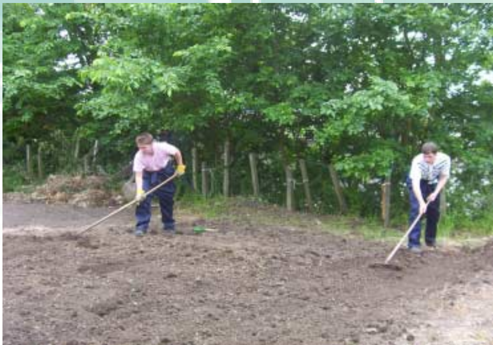
'Helm's Harvest' hard work begins on preparing the allotment project

The Helm also continues to be a dynamic organisation adding new dimensions to its work and continually responding to an ever changing environment and looking to the future. In the last year we have been grateful for donations which have enabled us to buy new computer equipment for students use, provide a music facility and most recently the opportunity for both Dundee and Arbroath students to grow their skills in our allotment project 'Helm's Harvest'.