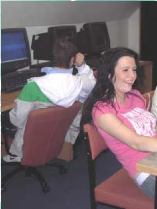
Clients enjoying the IT module in the modern IT suite